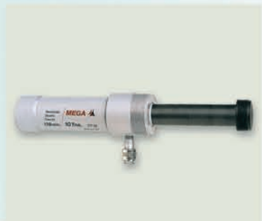
Pulling cylinder: Optional