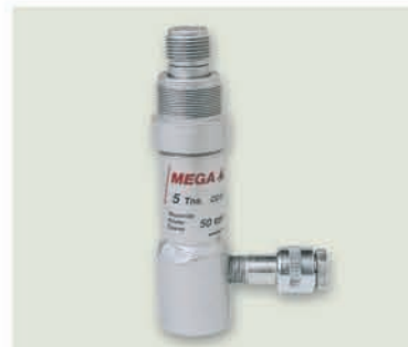
Pushing cylinder: Optional